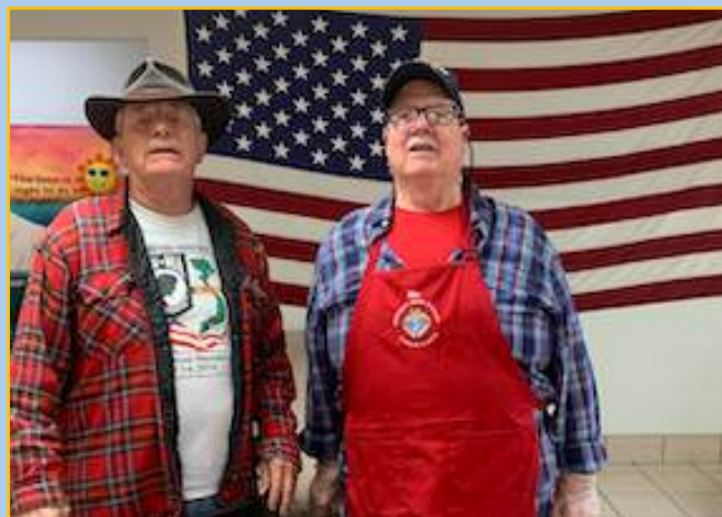
Daily Bread November 24