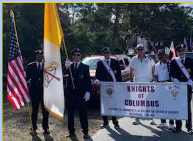
Veterans Day Parade — Saturday, November 9 — Palm Bay