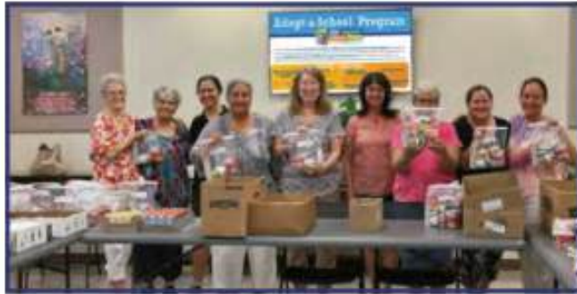
Women of Faith and Prayer Shawl Ministry assist with meal packing.

Under the guidance of The Children's Hunger Project, whose main office is in Cocoa, Ascension Parish has "adopted" three local elementary schools, committing to financing, packing, and delivering meals for the weekends for needy children in those schools. Currently we at Ascension support 183 children with weekend food packages, but that number is expected to grow based on historical trends. The Children's Hunger Project throughout Brevard County provides over 4,300 meals a week to needy children in 60 schools.