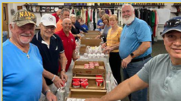
Packing meals for Children's Hunger Project