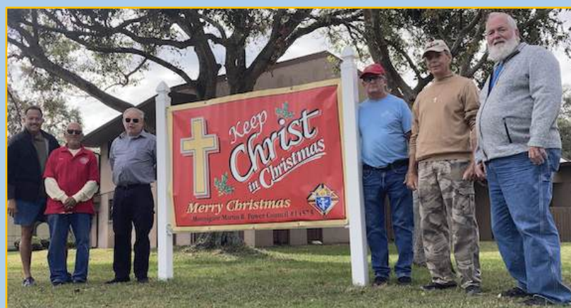
Christmas Nativity setup — November 30