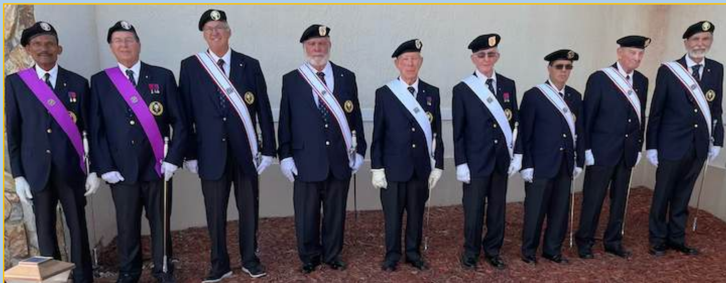
Funeral at Holy Name — November 19