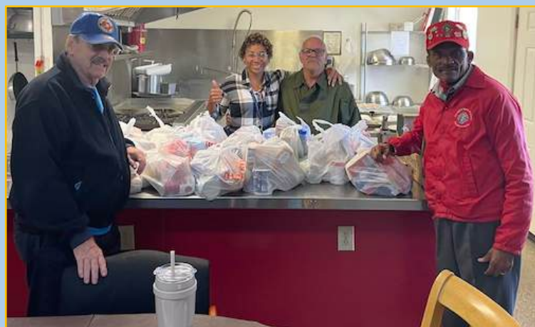
La Petite Academy Thanksgiving donations to the vets