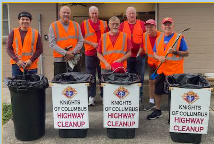
Highway Cleanup November 1