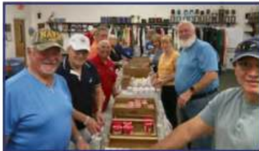
Knights of Columbus assist with meal packing.

A huge shout out of thanks to the Women of Faith Bible Study Group that packed 200 meals on September 17th, The Prayer Shawl Ministry that packed on November 7th, and the Knights of Columbus that packed on November 14.